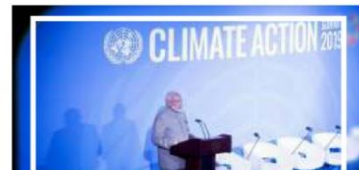
PM ADDRESSED THE UNITED NATIONS SECRETARY GENERAL CLIMATE ACTION SUMMIT

PM Narendra Modi received the award from Bill and Melinda Gates Foundation. Bill gates is the founder of Microsoft company, He was listed as the richest person many times by Forbes. PM Modi said, "This honour is not mine but of the crores of Indians who not only fulfilled the 'Swachh Bharat' dream but also made it a part of their daily lives".