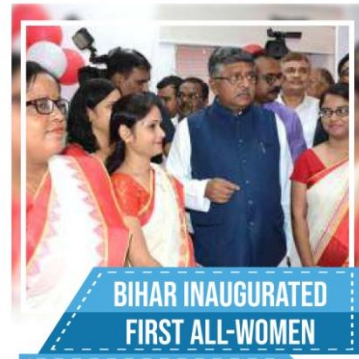
BIHAR INAUGURATED FIRST ALL-WOMEN EMPLOYEES POST OFFICE

Union minister, inaugurated (launched) the all-women post office on the campus of Bihar Public Services Commission (BPSC). Sub-post office of BPSC has been given the Position of Bihar's first all-women employee post office. Postal accounts will also be linked with Aadhaar card for better clarity.