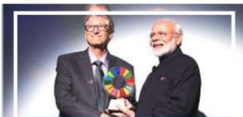
PM MODI GETS 'GLOBAL GOALKEEPER AWARD'

Union minister, inaugurated (launched) the all-women post office on the campus of Bihar Public Services Commission (BPSC). Sub-post office of BPSC has been given the Position of Bihar's first all-women employee post office. Postal accounts will also be linked with Aadhaar card for better clarity.