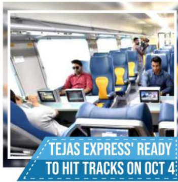
TEJAS EXPRESS' READY TO HIT TRACKS ON OCT 4!